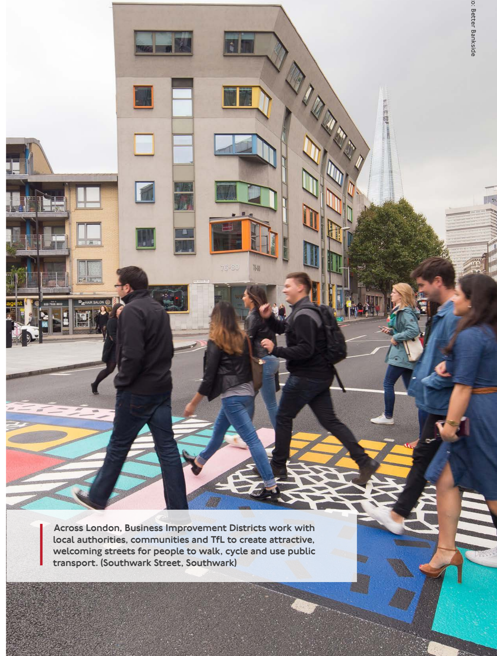
Across London, Business Improvement Districts work with local authorities, communities and TfL to create attractive, welcoming streets for people to walk, cycle and use public transport. (Southwark Street, Southwark)

The London Plan will be published in draft in 2017.